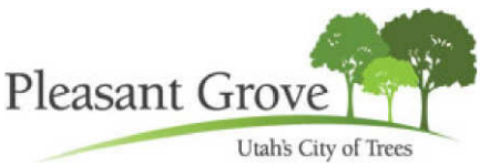
Figure 7 Pleasant Grove 2040 Roadway Master Plan

Notes: *New alignments shown represent only the approximate location for the future roadways. **Future traffic signal pending warrants being met as outlined in MUTCD. ***Potential future roundabout location pending more detailed traffic analysis as needs arise.